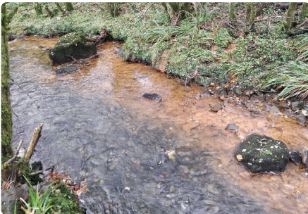
Mine water pollution.

Mine water pollution is bright and often orange in colour due to the presence of iron in the water.