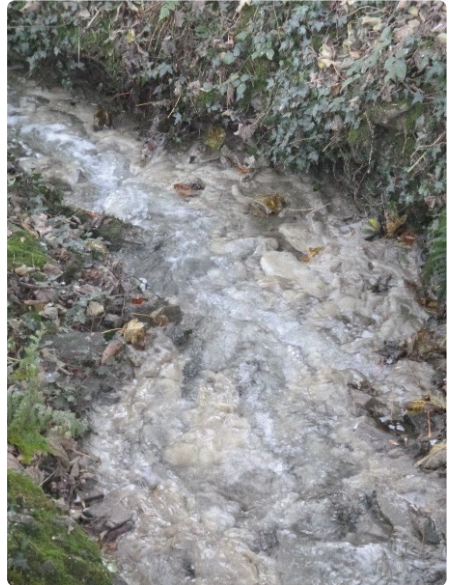
Sewage fungus resulting from a silage effluent.

Sewage fungus, but not always sewage – a symptom of pollution?