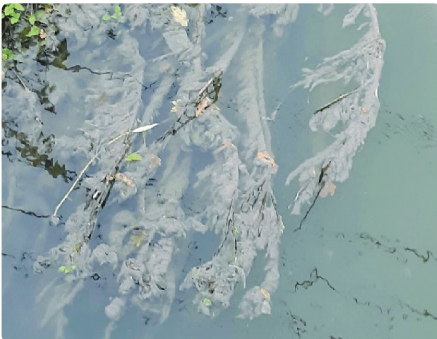
Sewage fungus resulting from a sewage spill.

Sewage fungus, but not always sewage – a symptom of pollution?