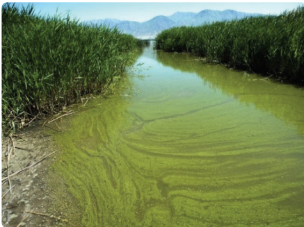
Blue-green algae (cyanobacteria).

They can also harm people, producing rashes after skin contact and illnesses if swallowed.