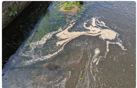
Natural algae foam in a river.