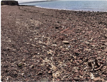
Seaweed spread along the coast.

Although it is naturally occurring, rotting seaweed is often mistaken for sewage, particularly as it can have the smell of bad eggs or rotten vegetables. This is due to the decomposing matter, which can be especially pungent in warm weather. High winds can increase the amount of seaweed washed up on the beaches.