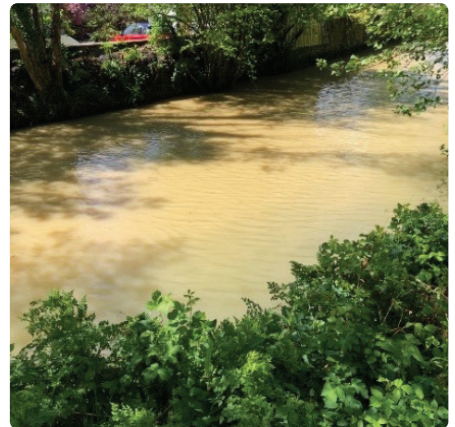
Sediment pollution.

If you notice your local river is a much browner colour than normal, it is worth reporting. Whilst this might not result in an immediate response, these reports help us to get an idea of ongoing poor land practice.