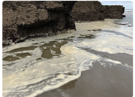
Sea foam.