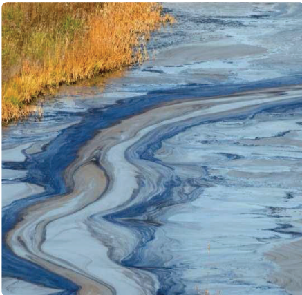
Oil spill

Oil pollution is commonly confused with the natural breakdown of organic matter, which can also present itself as an oily sheen. The key difference between the two, is that natural organic breakdown does not have an oil-like smell and breaks up into small pieces when disturbed. However, an oil sheen has a strong smell and breaks up into large clumps, quickly reforming the sheen after any surface disturbance.