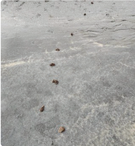
Dog fouling on sand.

This commonly gets misreported as sewage. Sewage effluent will have travelled through the sewage network, mixing and disintegrating by the time it reaches an outflow. Intact faeces are rarely present in sewage discharges.