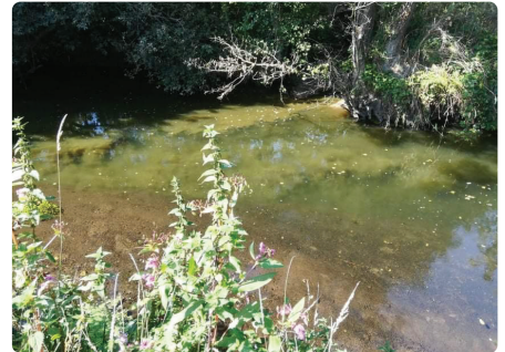
Slurry pollution in a river.

Slurry pollution is usually brown in colour, often associated with foam and has a distinctive smell.