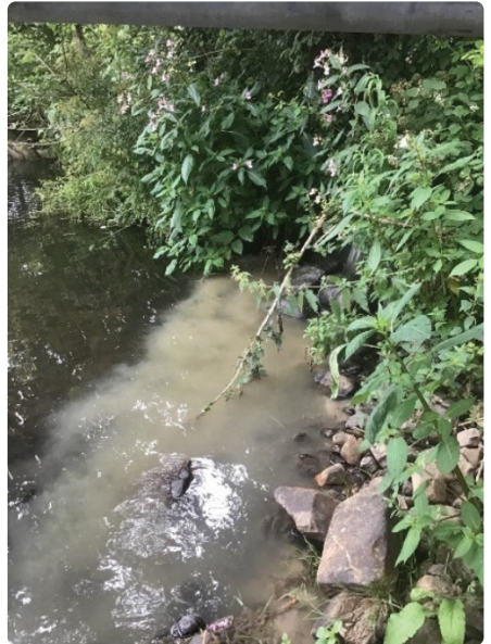
Sewage pollution in a river.