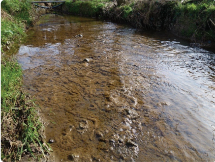
Sewage fungus resulting from a sewage spill.

Sewage fungus is grey in colour and often coats vegetation below the water's surface.